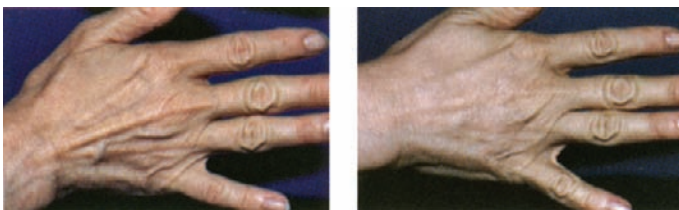
While the face is the most popular area for LipoStructure, it yields excellent results for hands as you can see in the before photo (left) and at the five-year follow-up appointment (right).

A follow-up of 2,000 of Coleman’s patients has shown that the results of his procedure have remained stable for ten years. Because most of us respond well to fat grafting, this technique appears to be a particularly effective way to help give our appearance a more youthful and appealing look.