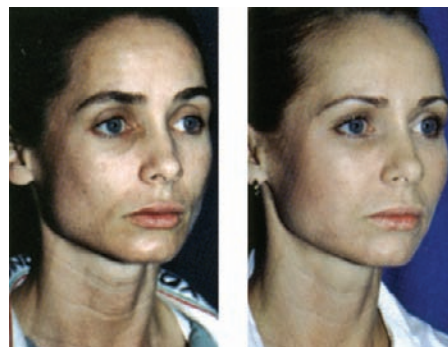
Attractive beforehand (left), this woman had fat grafting to add a more youthful, rounded look to her face—and after two-and-a-half years, it still looks good (right).